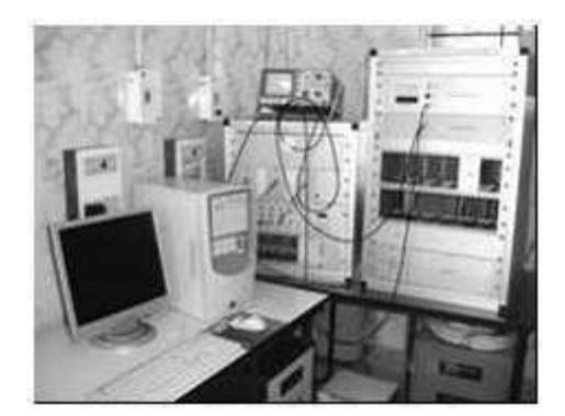
Figure 3. Partial reflection radar.