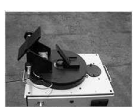
\label{eq:Figure 1. All-sky scanning photometer.}