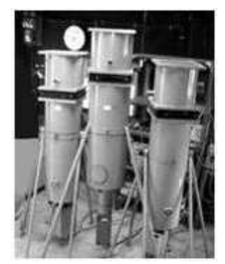
Figure 4. Night airglow photometer.