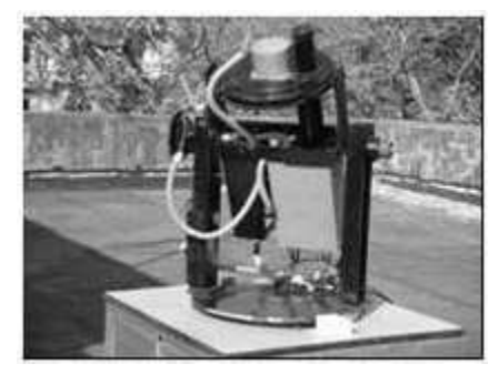
Figure 5. Meridian scanning photometer.