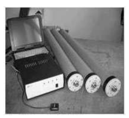
Figure 2. Search-coil magnetometer.