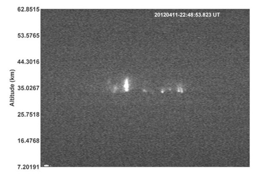
Figure 1. First optical image of sprites observed on 11 April 2012 at 22:48:53.823 UT.

On the night of 11 April 2012 at 22:48:53.823 UT, the first 'Sprite' events were recorded in Indian region above the thunderstorm (~35 km above the ground in the stratosphere) (Figure 1) located around (87°E, 24.5°N) ~220 km south east of Allahabad (25.4°N, 81.9°E) (Figure 2). The lightning activity (red dots) ± 5 min at 22:48:53.823 UT which produced the sprites is shown in Figure 2. This observation is important as it opens new questions about the generation of sprite and related phenomena as well as characteristics of Indian thunder clouds; previously it was thought that because of low energy associated with lightning discharges and absence of MCSs in Indian thunder clouds TLEs cannot be generated and observed. The lightning dataset used in the present observation to understand the characteristic