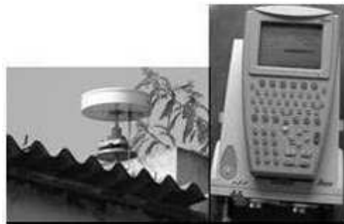
Figure 6. GPS setup.